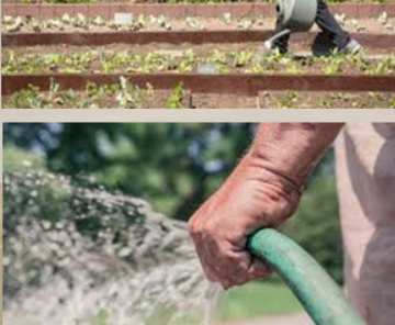
Plant vegetation and water dry land to stabilize soil

Avoid off-road travel and slow down on unpaved roads!