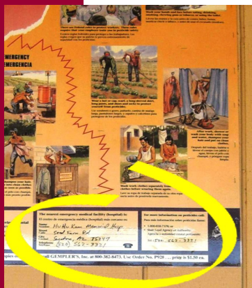
Medical information posting

"Know where the closest emergency medical facility is before an accident happens."