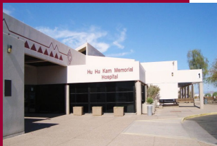
Hu Hu Kam Memorial Hospital, Sacaton

483 Seed Farm Rd Sacaton, AZ 85247 (520) 562-3321 (602) 528-1350